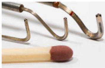
Ultra-miniature probes for finer, denser measurements