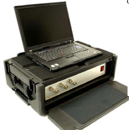
Compact carrying case